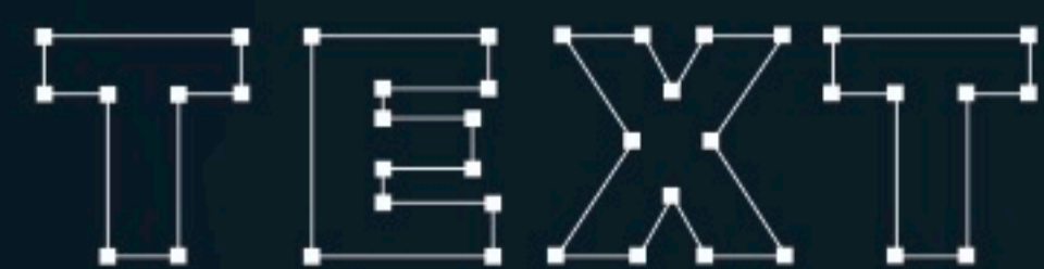
Text converted to outlines / Paths

It is our policy that all artwork including artwork supplied is sent back to the customer for approval to ensure that the files have the correct fonts etc.